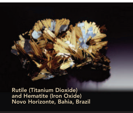
Rutile (Titanium Dioxide) and Hematite (Iron Oxide) Novo Horizonte, Bahia, Brazil

As the global economy shows signs of strengthening, we continue to be very actively involved in assisting our clients in meeting their business objectives. Properties continue to be developed, mines continue to be built and companies continue to consider growth through strategic mergers and acquisitions.